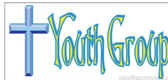
This Photo by